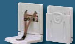
BC 100 BQS Page 351