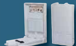
BC 100-EV Page 350