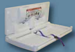
BC 100-EH Page 349