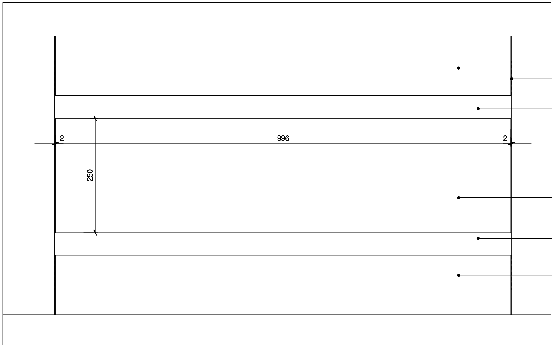
04 2361 ELEVATION DETAIL PLENUM BOX INTERFACE DETAIL G-G07-2