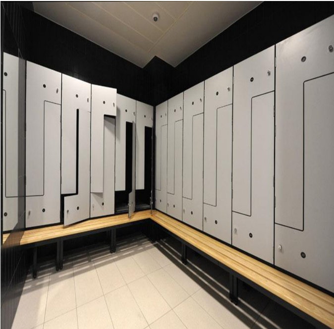
Maxwood Z Locker on Bench