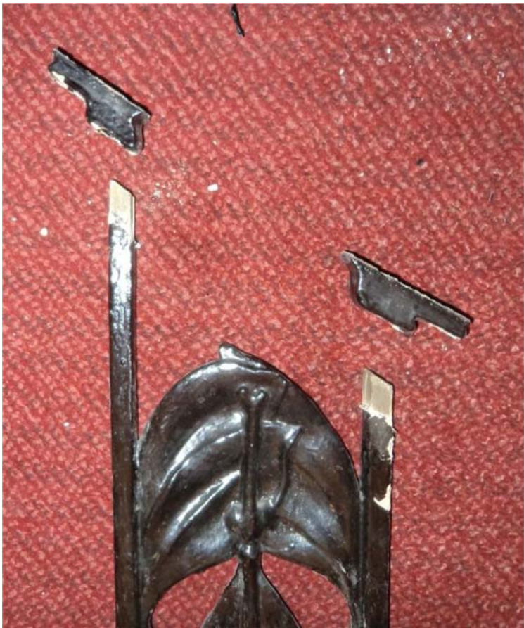
baluster adjustable fixings to handrail